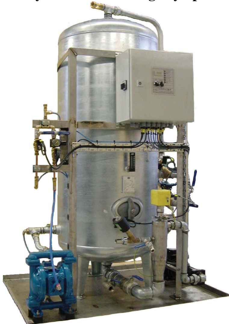
Marinfloc SDwU 300/500

Reduces your water in sludge by up to 85 %